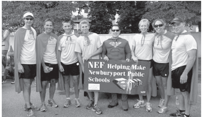
Yankee Homecoming Bed Race, 2011